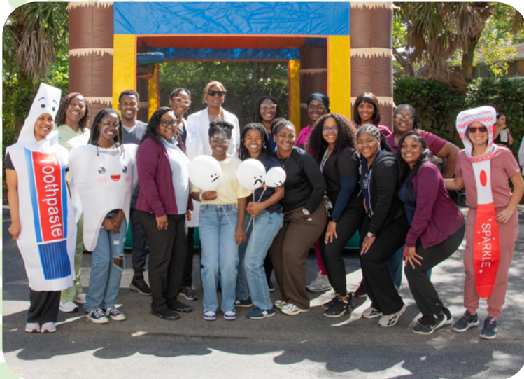
JTCHS staff and volunteers pose during the annual Give Kids a Smile Day 2026.